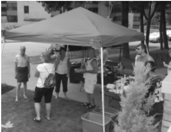
A beautiful day for our open house