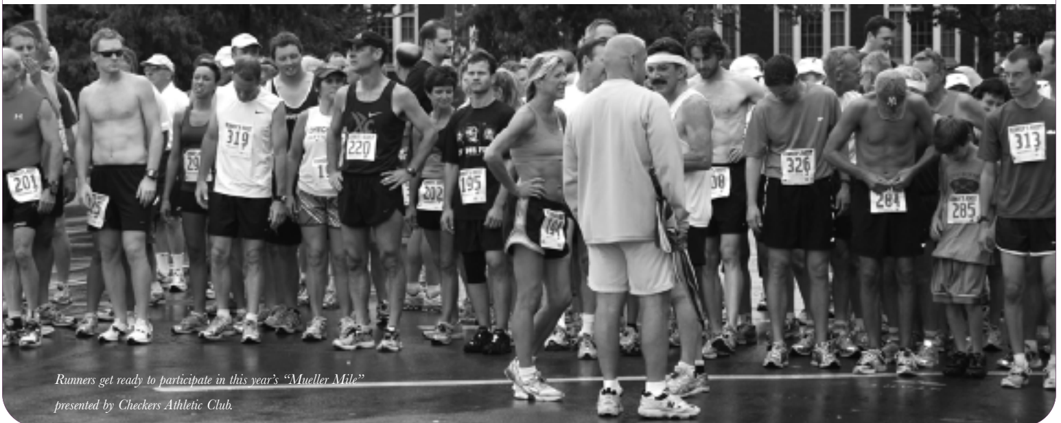
Runners get ready to participate in this year's "Mueller Mile" presented by Checkers Athletic Club.