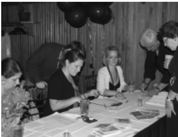
Volunteers busy with guests attending the "Wake"

Guests enjoyed the Annual Kevin Guest House Open House held on July 22. Tours of the Main House and gardens were conducted by volunteers and guests enjoyed food courtesy of Tops Friendly Markets and Rosina Food Products, Inc.