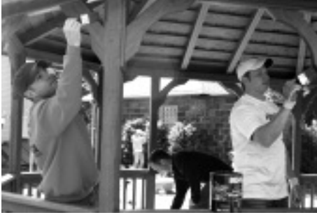
Wegmans Volunteers stain Healing Garden Gazebo