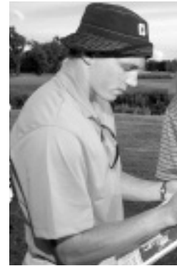
Patrick Kane, Jr.