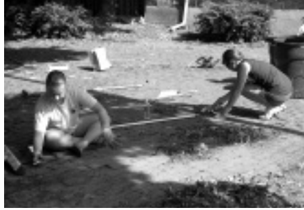
Cheektowaga Youth Engaged Service Help Around Kevin Guest House