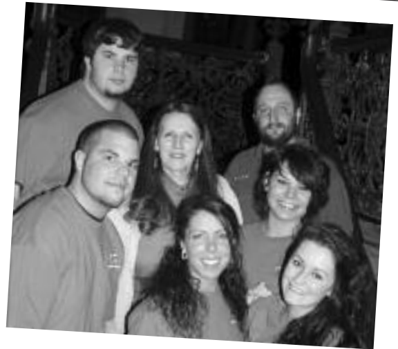
The Best Buy Volunteers were awesome!