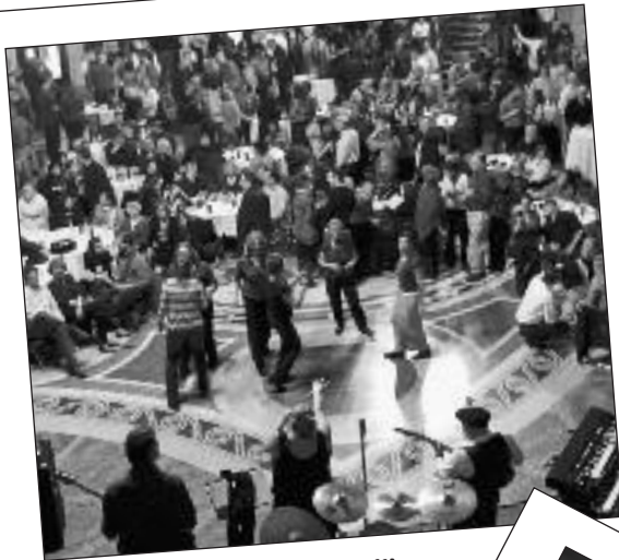
A great time was had by all!

Kevin Guest House held its first ever Blues & Brews event in mid March and it was a resounding success. The event raised more than $23,000 for KGH and our mission.