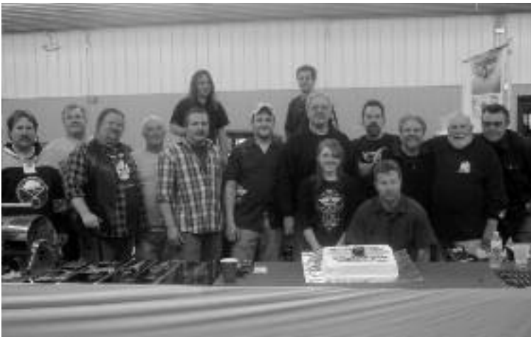
The pinstripe artists pose for a photo during the Calvalcade of Cars.